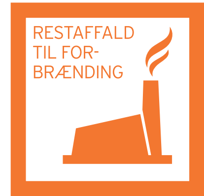
HOUSEHOLD WASTE FOR COMBUSTION, e.g.: